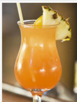
Christmas Island