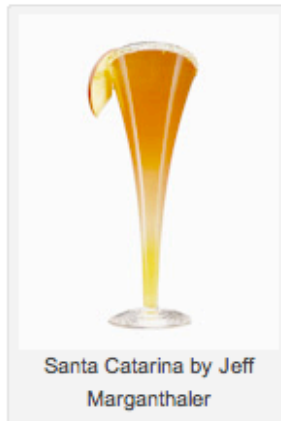
Santa Catarina

Shake ingredients with cracked ice until chilled. Strain into a chilled cocktail glass and garnish with freshly-grated nutmeg.